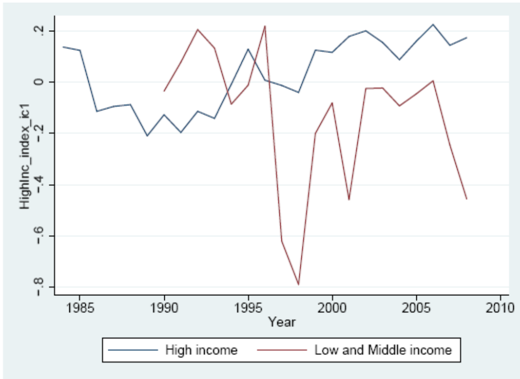
Figure 2. Integration Index, by Income Group (Excluding Malaysia, Thailand and Turkey)