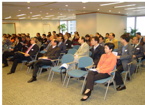
Participants in the joint workshop