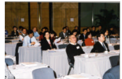
More than one hundred participants