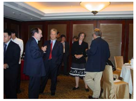
Discussion during the conference dinner