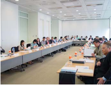
Speakers and discussants of the conference