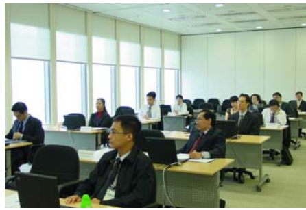
Participants from the region’s central banks